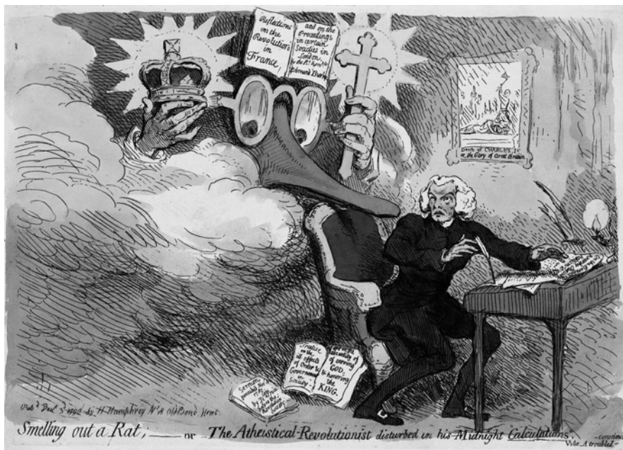
[Fig. 2] Smelling out a rat; or the atheistical-revolutionist disturbed in his midnight "calculations" . James Gillray (1790)

Meeting Richard Price, our sense of science grows.